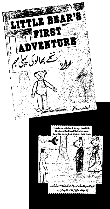
A dual language (English-Urdu) storybook created by 7th graders for younger readers.

Thornwood Public School, a K-5 school in the Peel District School Board in Toronto, Canada, pioneered the process of the dual language identity text (Chow & Cummins, 2003; Schecter & Cummins, 2003). As is common in many urban public schools in Canada, students in Thornwood speak more than 40 different home languages, with no one language domi-